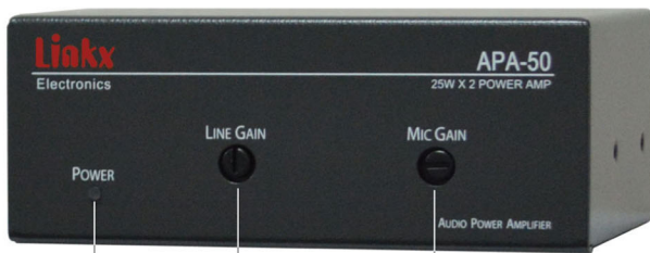
Power/Standby LED Green-on Amber-standby