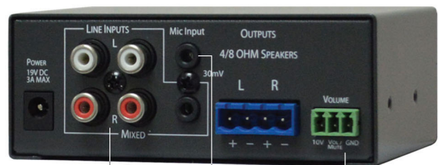
Line Inputs Mixing

Two line-level stereo inputs on RCA connectors plus one line-level stereo input on a 3.5mm mini-jack signals are mixed inside the amp at a 1:1:1 ratio.